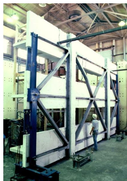
Research on techniques for strengthening existing RC structures in seismic zones

B eam-column joint behavior is one of the most complex of any building component. Subjected to large inelastic deformation reversals, the joint should be capable of resisting axial, flexural, shear, torsion and bond demands without exhibiting significant stiffness loss and energy dissipation capacity. Dr Jirsa's seminal work led to a deeper understanding on the resisting mechanisms, role of joint transverse reinforcement, the impact of transverse beams and floor slabs (see photo below), concrete compressive strength, as well as on the adequacy of retrofitting techniques of concrete joints. His contributions led to design code requirements used worldwide.