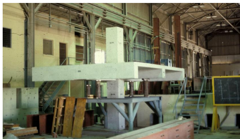
Development of design provisions for joints in RC structures subjected to seismic deformations