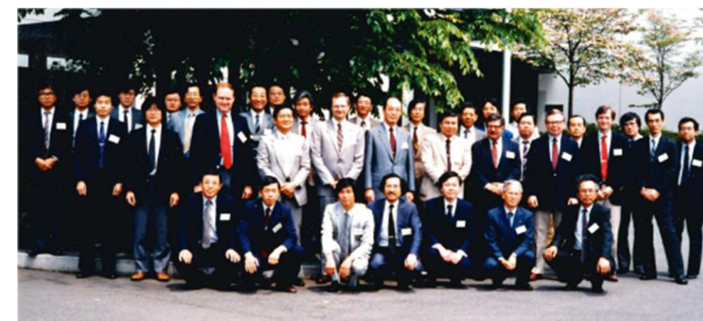
Seminar on Repair and Retrofit of Structures, Tsukuba, Japan 1987

H is first attendance at a WCEE meeting was in New Delhi in 1972. It was memorable experience meeting so many of the eminent earthquake engineers from all over the world. For the next 40 years, he attended nearly every WCEE. Those contacts led to cooperative research projects with colleagues in Japan, New Zealand, Canada, Mexico, and Turkey.